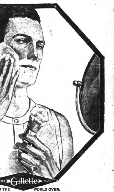
KNOWN THE WORLD OVER. Gillette Safety Razors, $5 and up. Blades, 50c. and $1.00 per Packet.