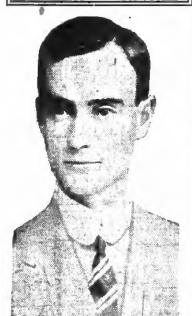
JOHN PURROY MITCHELL. He was elected mayor of New York city last night. Mr. Mitchell resigned the collectorship of the port of New York to which he had been appointed by President Wilson, to make room for Mayor Hiram W. Taft, Tammany candidate Mitchell is a young democrat who careered through marked by opposition to machine politics.