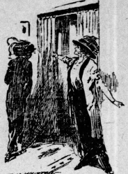
Rhoda marched, hurt, overwhelmed, astonished.

As she turned in at the gate Rhoda glanced up at the window where her mother usually sat.