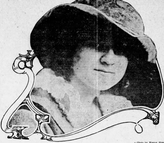
A young Atlanta girl who is possessed of unusual talent in painting. Her recent exhibition of sketches in oil, and in water color, of scenes in her most favorable comment.