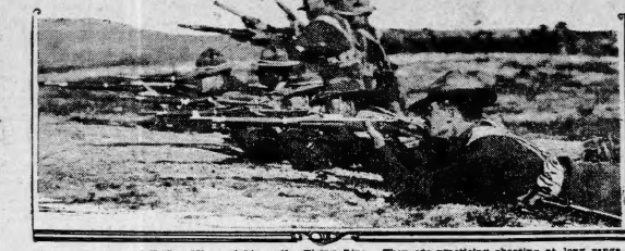
Here are a group of U. S. soldiers' sight on the firing line. They are practicing shooting at long ranges.