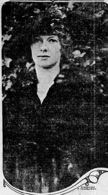
Here is the first specially posed photograph of Miss Helen Edwina Huntington, whom Vincent Astor will marry. This photograph of the fiancee of the richest young man in the world was made on the porch of her home just after the engagement was announced.