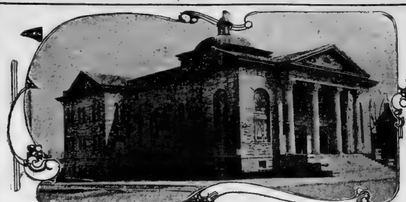
First Baptist church at Ocala, Fla. The Georgia Baptist convention opened there Tuesday morning.