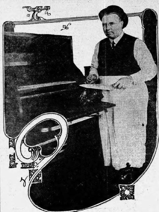
This shows one of Atlanta's leading hotel men who turned 'cock' at the Georgia dinner.