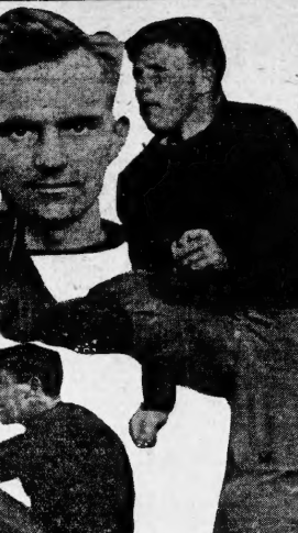
Caption for the portrait of a man.