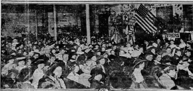
Scene at North Avenue Presbyterian Sunday school when 780 children were present, breaking the church's Sunday school attendance record. The Sunday school room had been greatly decorated for the occasion.